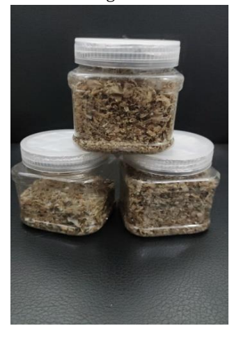
Dry fish meat processed for animal feed