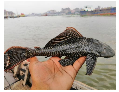
Fig. 1. Suckermouth catfish ( Pterygoplichtys disjunctivus ) collected from the river Buriganga

Suckermouth catfish (SMF), a remarkable species within the family Loricariidae, are native to the diverse freshwater ecosystems of Central and South America. Characterized by their distinctive armored bodies and specialized mouths, these fish exhibit a fascinating example of evolutionary adaptation (Mori and Nakamura, 2021). Over the years, the international aquarium trade has increasingly exploited the exotic allure of the SMF, catapulting them from the tranquil waters of their native habitats into the global spotlight (Page and Robins, 2006). The journey of the SMF from obscurity to popularity dates back to its mid-20th-century debut in the aquarium trade. Enthusiasts worldwide have been captivated by their unique appearance, along with their pragmatic algae-cleaning abilities (Guillén-Sánchez et al. , 2021). Beyond their aesthetic and practical value in aquariums, these catfish contribute significantly to their native aquatic ecosystems. Their feeding habits naturally curtail algae blooms, fostering a balanced, biodiverse environment (Seshagiri et al. , 2021).