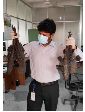
Some largest Suckermouth catfishes collected from the river Buriganga, Bangladesh