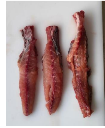
Sucker mouth catfish fish fillet