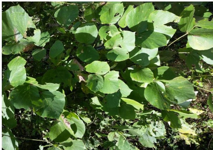
Fig. 12. Pueraria lobate , collection site with host plant (Bandarban District, Bangladesh)

Empoasca terminalis Distant (1918): Hossain et al. (2023)