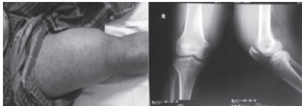
Fig:1 Picture of right Knee joint and X-Ray of right knee

He was also negative for HLAB27 alleles. After exclusion of all possibilities and two episodes of synovial biopsy was done without conclusive remarks. Then he was labeled as spondyloarthritis and treated with NSAIDs, sulfasalazine, intra-articular steroid for two years without significant improvement. He was referred to a tertiary hospital in Bangladesh. Here patient was reevaluated and further drive was given to reach diagnosis. Radiographs of the right knee shows no bony abnormality. Ultrasonography shows synovial hypertrophy and moderate fluid collection but no Doppler activity.