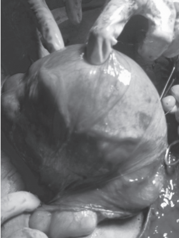
Figure-2: Hugely distended bladder with the fallopian tubes on posterior aspect of uterus

Due to too loose peritoneal reflection at utero-vesical fold the bladder was pulling up along with the enlarging uterus throughout pregnancy. For the same reason the broad ligaments were filled up with enlarged uterus and hence the tubes with ovaries were found on posterior aspect of uterine body. The sigmoid mesocolon was loosely attached up to left para colic gutter and rectum was hanging from posterior surface of cervix with loose peritoneum (instead of attachment on posterior aspect of vagina). The caecum and appendix were protruded out through incision margin of abdominal wall while lower segment caesarian section was completed (Figure-3).