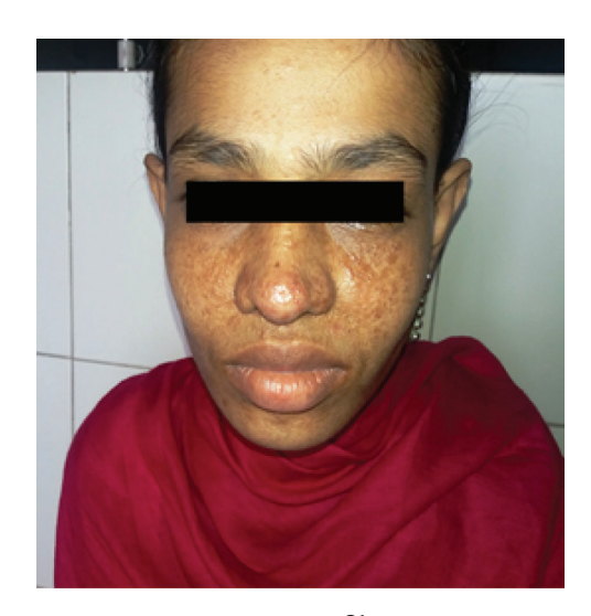
Figure 1: Angiofibromas