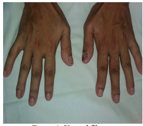
Figure 3: Ungual fibromas