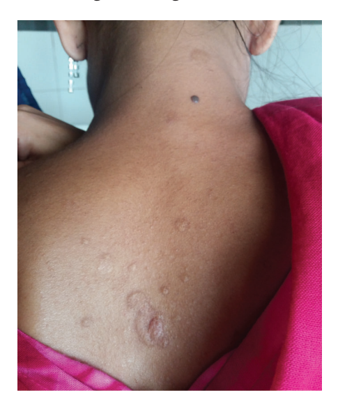
Figure 2: Shagreenpatches (Hyperpigmented plaque)