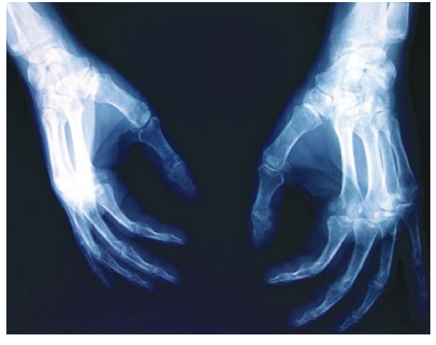
Figure-2: X-ray of both hands showing normal findings