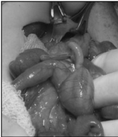
Fig-2. Defect of the diaphragm through Which the herniated intestine and colon has pulled out.