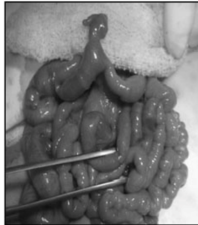
Fig-3. Meckles Diverticulum in a case of CDH