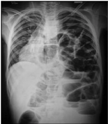
Fig-4. Radiograph of CDH with intestinal obstruction