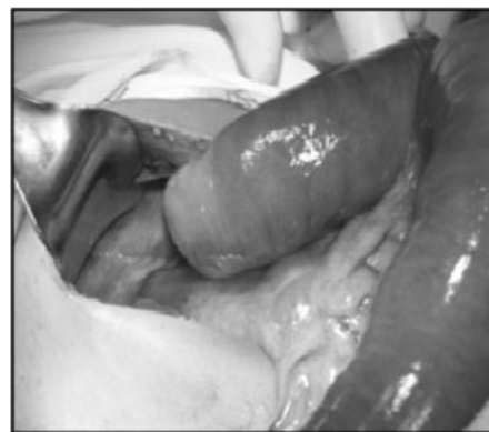
Fig-5. Intestine is obstructed in the defect of CDH of same case (fig-4).