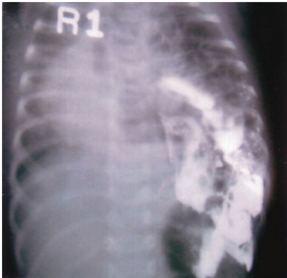
Fig-2. Contrast GIT X ray showing intrathoracic intestine.

but one baby needed additional assisted ventilation with ETT (endo-tracheal tube) and AMBU (artificial manual breathing unit) bag for 24 hours after an transient attack of cyanosis. All babies tolerate feeding well postoperatively after bowel movement.