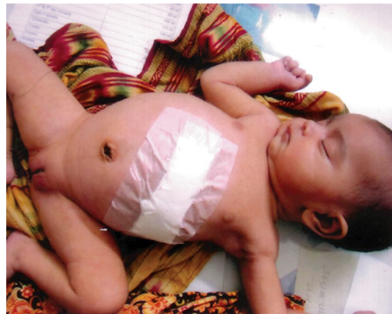
Fig-4. Baby, 5 days after operation

Postoperative X-ray showed good lung expansion, correction of mediastinal shifting and no evidence of any pleural effusion. All study cases (n=12) of CDH survived. So survival rate was 100%. No wound complication was reported. During follow-up weight gaining was smooth and uneventful.