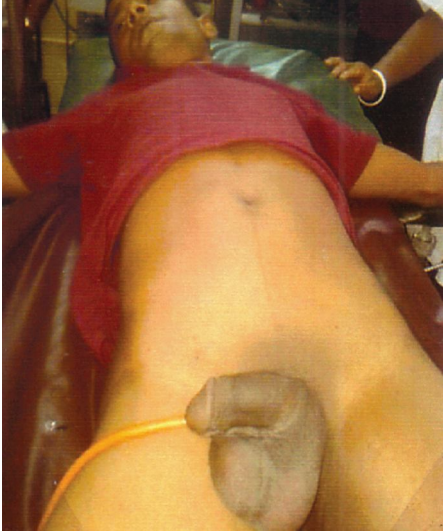
Fig 1 : Left femoral pseudo aneurysm with AVF

On examination, the patient was moderately anemic, non icteric, there was no palpable ipsilateral inguinal lymph node. The patient was of average built with good nutrition, pulse 89 b/m, BP 120/70 mmHg, RR 18/m, Temperature 98.0F. On local examination the swelling was about 25x20 cm (Fig.1) elongated,