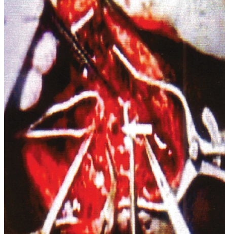
Fig 3 : Thrombus in the sac

Under spinal anesthesia, good antiseptic skin preparation and all aseptic precaution with systemic heparinization through vertical incision the mass was explored (Fig 2). At first proximal