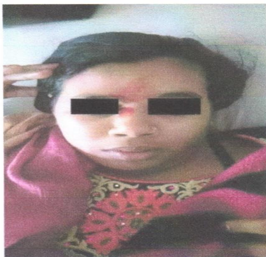
Figure 2: Blood mixed sweat from face