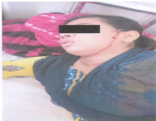
Figure 1: Blood mixed sweat from face

No history of any previous bleeding manifestation was available. No drug history to mention expect occasional NSAIDs for headache.