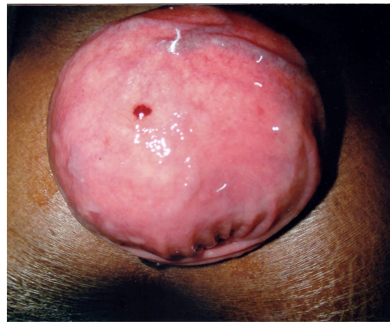
Fig. 2: 42 years old man showing a large mass of recurrent rectal Gist about 12 cm in diameter in the perineum.