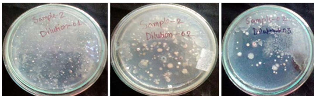
Figure 1. Colonies of actinomycetes appeared on the dilution plates using the soil samples.

Optimization and cultural conditions: The isolate FEAI-1 was grown on different ISP culture media. Among the inorganic salt-starch agar media (ISP Medium 4) was best for the culture of FEAI-1. The strain FEAI-1 was assigned to the genus Streptomyces sp. based on its microscopic and cultural characteristic (Figure 3).