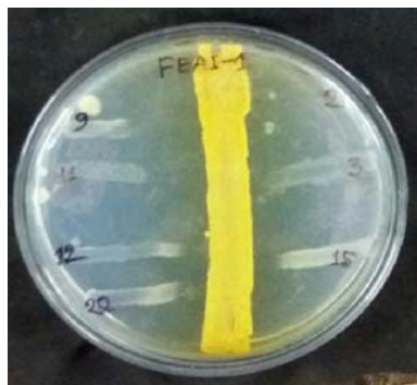
Figure 2. Screening for the antibacterial activities of the isolate FEAI-1 through cross streaking method, Bacillus cereus (2), Staphylococcus aureus (3), Escherichia coli (9), Shigella dysenteriae (11), Shigella sonnei (12), Agrobacterium sp. (15), Shigella boydii (20).