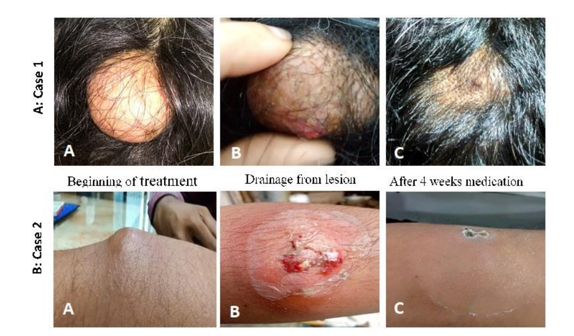
Figure 2. Chronological changes of lipoma (left to right). A: Before treatment, B: Drainage from the lesion, and C: After 28 day's medication