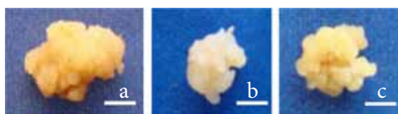
Fig. 1. Callus of a) BRRi dhan48 (yellowish), b) BRRi dhan28 (whitish) and c) BRRi dhan33 (light yellowish). Scale bar = 0.5 cm.

the callus was whitish in BRRi dhan28 and light yellowish in BRRi dhan33 (Fig. 1a, 1b and 1c).