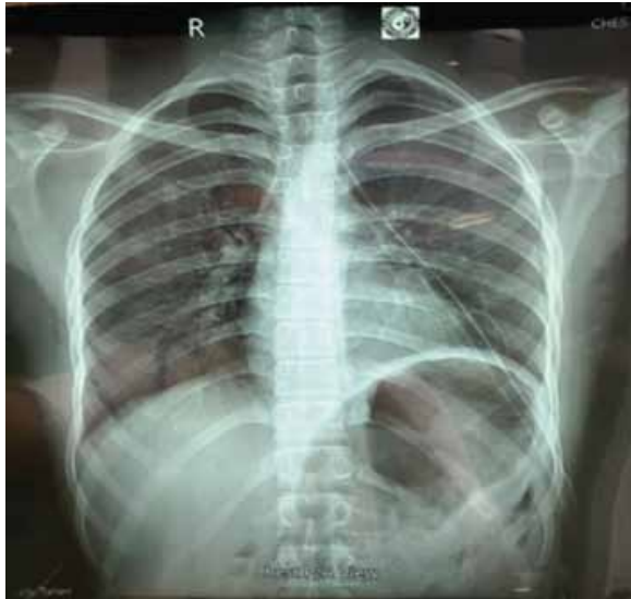
Figure 4: Post-operative chest x-ray P/A view showing chest drain tube in situ, normal contour of left dome of diaphragm, gastric bubble below the left dome of diaphragm.

Abdominal drain tube was kept in the site of repair & a chest drain tube was inserted. Nasogastric tube was kept for 3 days. He was kept nothing per oral for 3 days. Post-operative period was uneventful (Figure-4).