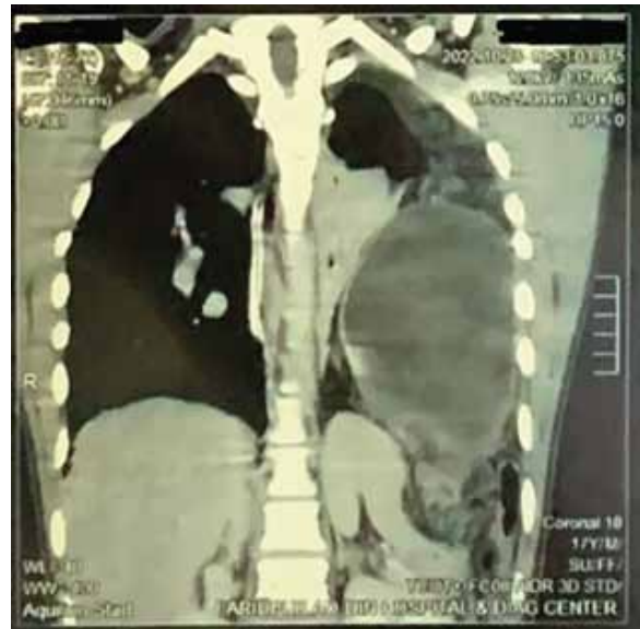
Figure 2: Coronal section of CT scan of chest showing large bowel loop along with peritoneal fat entered into left hemithorax.

CT scan of chest showed large bowel loop along with peritoneal fat entered into left hemithorax through abnormal opening in the postero-lateral aspect of diaphragm, left lung is collapsed & mediastinum was shifted to the right (Figure-2).