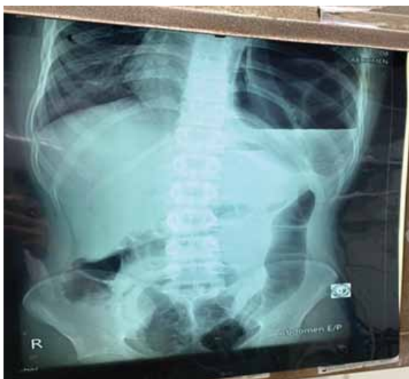
Figure 1: Plain X-ray abdomen showed loops of bowel were high-up, lying in the left lower hemithorax, no evidence of pneumoperitoneum or abnormal air fluid level was seen.

A 17-year-old boy came to our surgery department with the complaints of recurrent upper abdominal pain for last 1 year which was burning in nature, insidious on onset, non-radiating and aggravated after taking meal. The pattern of pain changed to continuous and agonizing nature with increasing severity for last 3 days before hospital admission with vomiting for several times for last 24 hours. He gave no history of surgery or trauma. On examination, abdomen was diffusely tender, maximum over epigastric & left hypochondriac region, with rigidity and muscle guarding. Chest movement was normal, vocal fremitus was reduced on left side, percussion note was dull and on auscultation breath sound was diminished on left lower chest with presence of bowel sounds in the left hemithorax. Plain X-ray abdomen showed loops of bowel were high-up, lying in the left lower hemithorax. There was no evidence of pneumoperitoneum or abnormal air fluid level (Figure-1).