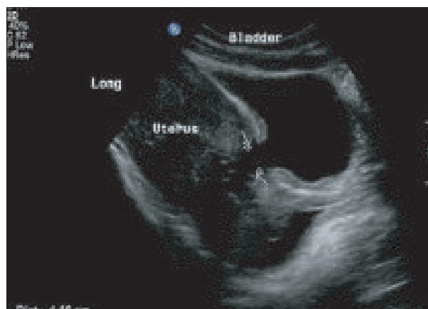
Fig.-1: Uterovesical fistula (arrows) on ultrasound scan

scan (fig-1), hystero-graphy showed the flow of contrast from the uterus to the bladder (fig-2). Cystoscopy showed a fistulous opening in the bladder measuring about 7 mm in size. It was supratrigonal in position. Intravenous pyelography showed a normal upper renal tract. The bladder capacity was normal. The vesicouterine fistula was then treated by local repair through transperitoneal route. Intraoperatively dense fibrous adhesions were found between the lower segment of the uterus and the