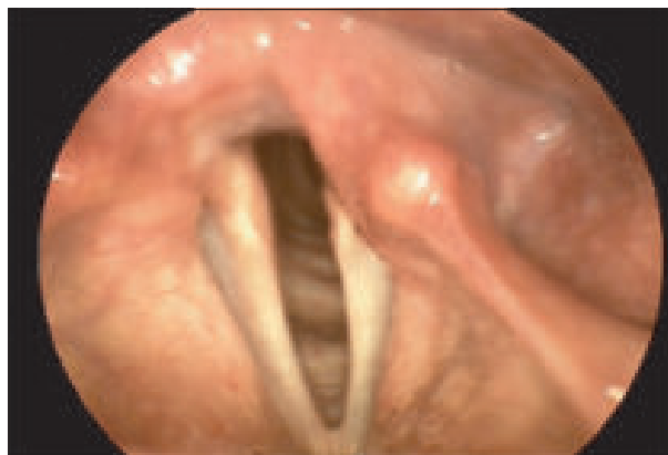
Fig.-1: Thinning of vocal fold tissues causes the vocal fold margin to appear scalloped or concave.

Under normal circumstances, the edge of the vocal fold stretches in a straight line between its attachments from thyroid cartilage to arytenoid cartilages in back of the larynx. Atrophy of the vocal fold muscle and thinning of the superficial vibratory tissues generally causes the edge to take on a scalloped appearance (Fig - 1). 9