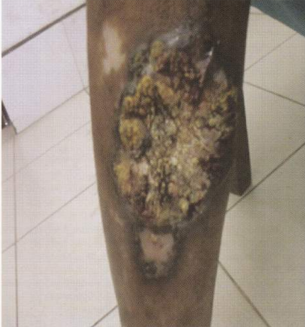
Fig-1: A large well defined verrucous plaque with adjacent lichen planus plaque

(the ulcer showed(Fig.4) multiple cellular atypia with keratin horn pearls done under local anesthesia on 28.01.2013, referred to a diagnosis of squamous cell carcinoma.)