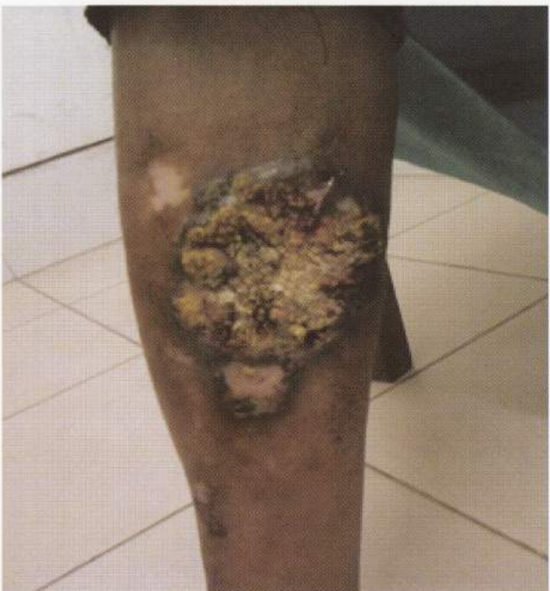
Fig-2: Multiple depigmented hypertrophic plaques surrounding a large plaque