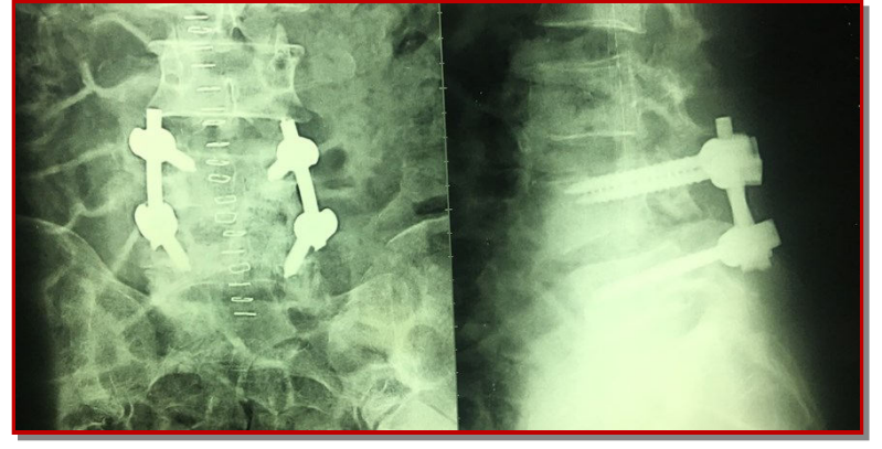
Figure 3: Post-operative X-ray of L4/L5 listhesis

Average follow-up was 3 and 6 months. The union