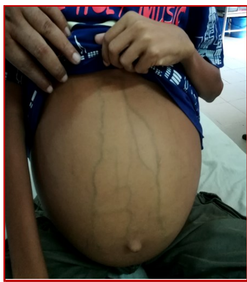
Figure 1: Distended abdomen, visible engorged vein and huge ascites

(14.8 sec), international normalized ratio 1.25 and normal alanine aminotransferase level (9 U/L). Serum electrolyte and creatinine levels were also normal. The ascitic fluid examination showed total cell count of 160 cells/mm 3 with 10% polymorph nuclear neutrophils and 90% lymphocytes. The biochemical examination showed the protein level was 5.5 g/dL and the sugar level was 5.3 g/dL. The adenosine deaminase level was normal. The serum ascites albumin gradient was high of 1.5 (>1.1). Endoscopy of the upper gastrointestinal tract revealed a developing varix (Figure 2A). Ultrasonography of the abdomen showed hepatosplenomegaly with huge ascites. Color doppler study showed a compressed middle hepatic vein due to enlarged caudate lobe (8.5 × 3.9 cm), loss of normal flow characteristics, hepato-fugal flow direction and features of mild portal hypertension but no thrombosis was found. Computer tomography venogram of the liver revealed portal vein was dilated, tortuous and produced varices along with the spleno-portal circulation (Figure 2B). Mantoux test and Chest X-ray were normal. Blood for inherited deficiency revealed a deficiency of protein S and antithrombin III but protein C was normal (Table I).