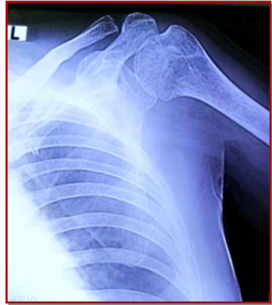
Figure 1: Plain X-ray of left shoulder joint anteroposterior view

surgery. 3,4 Clinical features revealed limited arm abduction, winging of scapula, and weakened shoulder shrugging. There is also marked muscular atrophy, especially supraspinatus, infraspinatus, and trapezius muscles with a normal passive range of motion of the shoulder joint. Prolong neck extension accompanied by excessive stretching of the spinal accessory nerve while under anesthesia may have resulted in ischemia and subsequent injury secondary to traction. Typically, X-ray of the shoulder joint reveals normal findings and nerve conduction study of the spinal accessory nerve demonstrates diminished amplitude to the upper trapezius. Prolong latencies to right upper, middle trapezius and an absent response to lower trapezius are other findings of nerve conduction study. Electromyography of the left upper limb reveals no other abnormalities except in the upper portion of the trapezius muscle, where fibrillation potentials and positive sharp waves are present. 3,5