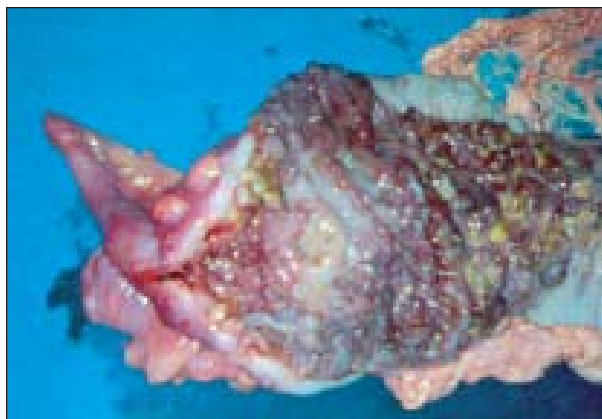
Fig. -1 : Part of the right hemicolectomy specimen showing cavernous haemangioma of caecum and ascending colon