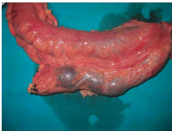
Fig.-2: Engorged veins in mesorectum

A female patient of 20 years presented with similar features like that of first case. She also had several units of blood transfusion. She under went haemorrhoidectomy 3 years back. Clinical examination revealed moderate anaemia. Abdominal examination was normal. Digital rectal examination revealed fresh blood, spongy rectal mucosa. Colonoscopy revealed thick, edematous bluish discolored rectal mucosa extending from dentate line up to 30cm. After preparation of the patient, laparotomy was done. Rectum and sigmoid colon was found thickened with engorged vein on the surface. Inferior mesenteric vein was hugely dilated (Fig. 2) involving rectum and lower part of the sigmoid colon. The involved gut was excised along with mesorectum. Gut continuity was established with hand sewn coloanal anastomosis with a covering ileostomy. Post operative recovery was uneventful.