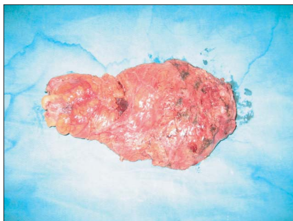
Fig-3 : Excised rectum with thick edematous mesorectum

This was a young male patient of 23 years. He presented with an acute onset of rectal bleeding for which he was transfused several units of blood. Similar intermittent episode had occurred in the past since his early childhood. He was operated in the past for rectal bleeding. Except anemia, there were no abnormal physical findings. Rectal examination revealed fresh blood with smooth, soft spongy mucosa. Colonoscopy revealed angry looking engorged mucosa with bluish discoloration extending from lower rectum up to lower sigmoid colon. On laparotomy, mesorectum was found very thick, swollen and edematous (Fig. 3). Dilated veins were present over the serosal surface (Fig. 4). Mobilization of the thick mesorectum was very difficult through narrow pelvic cavity. With slow and meticulous dissection an ultralow anterior resection with stapling anastomosis was done. Histopathological examination revealed cavernous haemangioma in all the