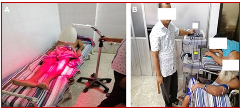
Figure 2: Patient receiving infra-red radiation therapy (A) and electrical stimulation therapy

the blood flow is restored. Hemorrhagic stroke on the other hand is caused by a leaking blood vessel and certain risk factors are responsible like unhealthy diet, inactivity, excessive alcohol consumption, tobacco, and certain medical conditions. Proper medical evaluation and multidisciplinary team management based on the type of stroke are vital to recovering from a stroke. After proper medical and surgical management, rehabilitation is mandatory for early recovery and preventing disabilities, including therapeutic exercise, therapeutic modalities, speech therapy, cognitive therapy, occupational therapy, and proper home caregiver training. 7,9