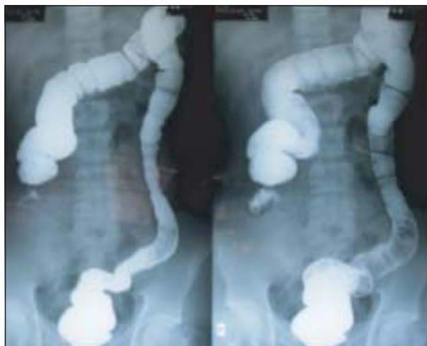
Plate-1: Barium enema showing normal study up to ascending colon

infiltration of chronic inflammatory cells which probably represent the fistulous tract. All the lymph nodes showed reactive changes. No granuloma or evidence of malignancy was found. The diagnosis was lymphoid polyposis. The patient had an uneventful recovery and went home after discharge with routine advice. At two months follow up the patient is asymptomatic and is doing well.