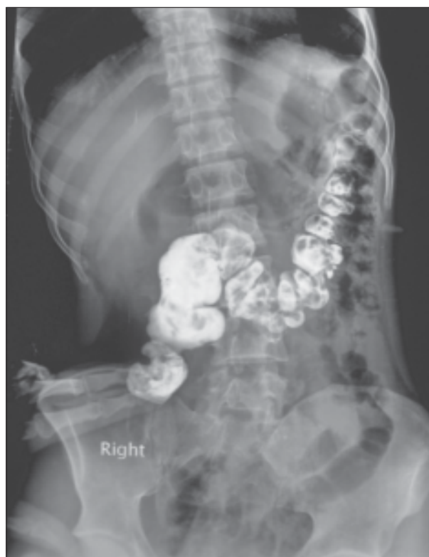
Plate-2: Fistulogram showing cutaneous opening in the right lumbar region, and communication with ascending colon