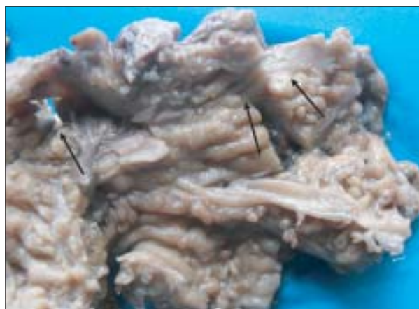
Plate-3: Multiple polyps (black arrows) in the mucosa throughout the specimen