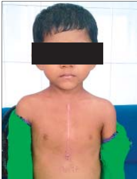
Fig.-3: Patient on subsequent follow up.

Patient was operated on 18.09.2013. Under general anesthesia with all aseptic precautions standard median sternotomy was done. After thymus dissection pericardiotomy was done. Cardiopulmonary bypass was established with bicaval cannulation with aortic cannulation. Heart was arrested by giving crossclamp and antegrade cardioplegia under mild hypothermia (32 0 C). Left artriotomy done. Mitral valve annulus was very much dilated; leaflets were thinned out, rudimentary posterior mitral leaflet. Morphology of mitral valve totally distorted and it was beyond repairable. Mitral valve replacement was done with 25 mm Edward Life Science porcine tissue heart valve with total preservation of subvalvular structure (figure-2).