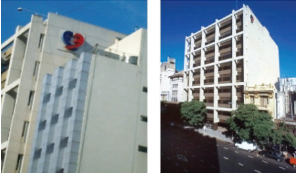
Fig.-4: Favaloro Foundation, Argentina.

Diamond Konex Award as the most important scientist in the last decade in his country (Argentina, 1993); and the Prince Mahidol Award, granted by His Majesty the King of Thailand (Bangkok, Thailand, 1999). In 2007, he was named the second greatest Argentine of all time, on the TV show El Gen Argentino . On July 12, 2019, Google showed a Doodle celebrating what would have been his 96 th birthday.