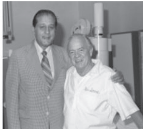
Fig.-2: A- Rene G Favaloro with Donald B- Effler and Rene G Favaloro with Masone Sones in Cleveland.