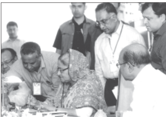
Inauguration of Stamp by Hon’ble Prime Minister Sheikh Hasina

Unique feature of the stamp are: (I) it is rombus shaped-first Bangladeshi stamp of this odd shape (II) It is first Bangladeshi stamp depicting Heart as a theme.