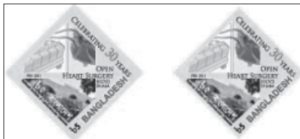
First Rombus shaped Bangladeshi stamp to commemorate 30 th anniversary of open heart surgery in Bangladesh