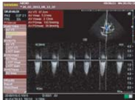
Fig-3: Transthoracic and Transesophageal echocardiography showing severe Aortic stenosis.