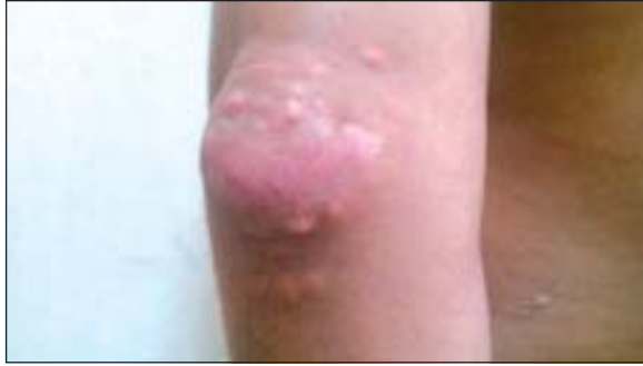
Fig-1: Xanthomatous lesions back of elbows.