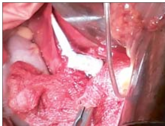
Fig.-3: On-table image during surgery showing 7 mm ringed graft which was anastomosed with the aorta, the distal end of which was anastomosed to a 4 mm non-ringed graft. The latter was then anastomosed to SMA.