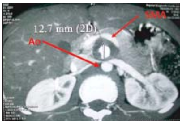
Fig.-1: CT scan showing a saccular dilatation of the mid superior mesenteric artery, with the dilated segment measuring 3.9cm x 2.3 cm along with thrombus.

Following adequate preparation, surgery was done: the aorta was explored via intra peritoneal approach & SMA was identified at its origin; its distal part was explored along the gut. Aneurysmal sac was excised and bypass grafting was done between infra-renal part of aorta and SMA distal to the aneurysm, using polytetrafluoroethylene (PTFE) graft. Gastro-intestinal activity resumed after 2 days and oral nutrition was commenced 3 days after surgery. The patient was discharged from the hospital on 5 th post-operative day in stable condition and has been well and symptom-free at subsequent follow up.