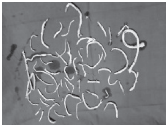
Fig-1: Collected Coronary atheromatous plaque during CABG surgery.

In open methods, a longitudinal incision for coronary arteriotomy is performed distal to the atheromatous