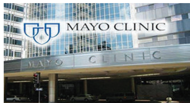
Fig.-2: Mayo Clinic, Rochester, Minnesota.