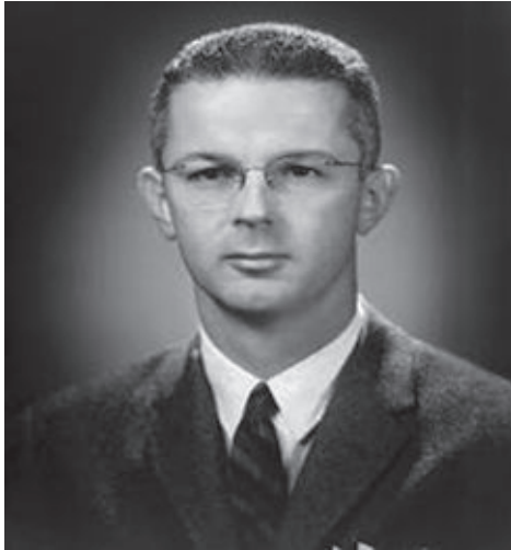
Fig.-1: John W. Kirklin in Mayo Clinic.