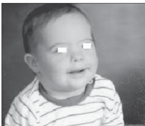
Fig.-1: 4 year old baby with Down syndrome and VSD.

Investigations: Echocardiography revealed a moderate size (7 mm), membranous ventricular septal defect with a shunt from left ventricle to right ventricle (fig:1). Karyo typing of the child was done and showed trisomy of chromosome 21, haemoglobin was 11 g/dl, renal function test and electrolyte was normal.