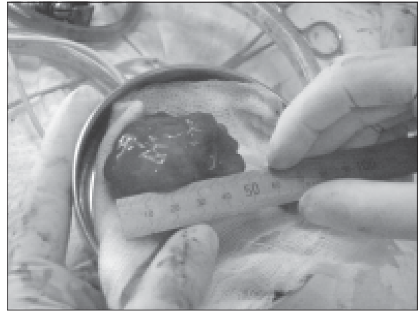
Fig-3: LA myxoma, just after excision