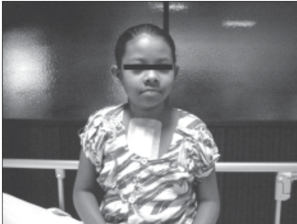
Fig-1: 8 yrs girl having LA Myxoma (post operative picture)

Over the next week, the child made an uneventful recovery with improved mitral valve function on echocardiography. Histological examination revealed the mass to be an atrial myxoma, with complete excision of the base.