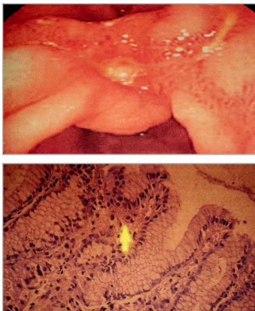
Figure 1 & 2: Photographs of Endoscopic snap shot showing ulcer in stomach, H & E stain of tissue from endoscopic biopsy showing H. pylori in the crypt.

calculated by unpaired t-test, chi square test and validity test. Data were edited, cleaned and analyzed by statistical package for social science (SPSS-17.0). The test was considered significant when P value <0.005).