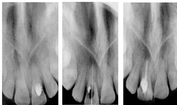
Calcified upper central Length measuring X-ray After Obturation

The case was negotiated using the same procedure as Case: 1 but it was completed in two sittings to avoid any risk using calcium hydro-oxide dressing after the 1st sitting.