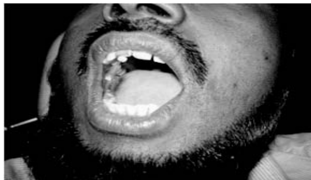
After endodontic treatment followed by Pin retained composite restoration.