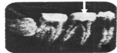
Fig-2 : Showing an x-ray of right lower 1st molar tooth. (periapical view)

With the clinical and radiographic findings the diagnosis was made as a case of chronic closed pulpitis with periapical abscess.