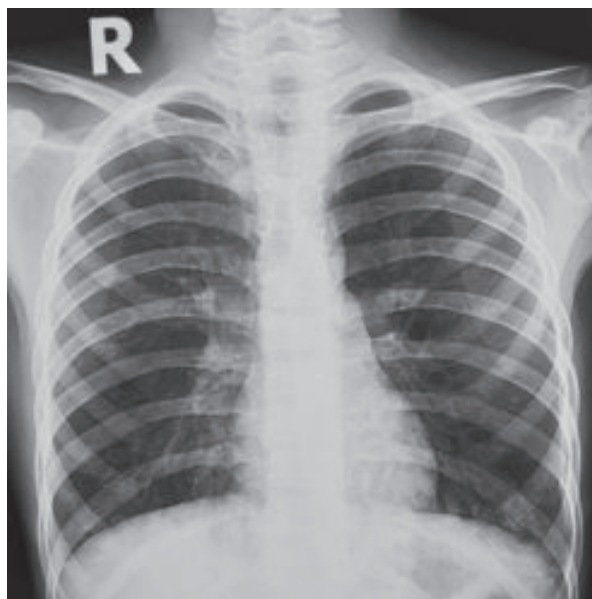
Fig-1: Chest X-ray

CT scan of chest showed an elliptical structure (Foreign body measuring about 12mm × 4mm) with