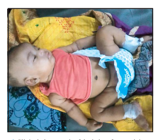
Figure 3 Clinical photograph of the baby after receiving treatment