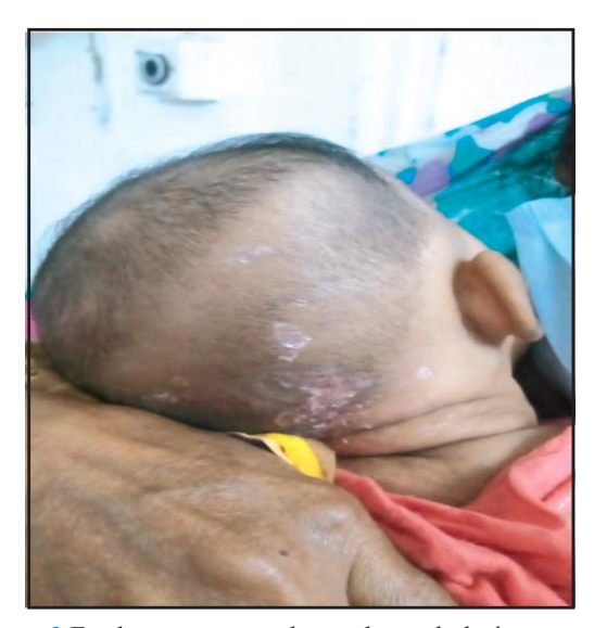
Figure 2 Erythematous maculopapular scaly lesion over the occipital region of scalp