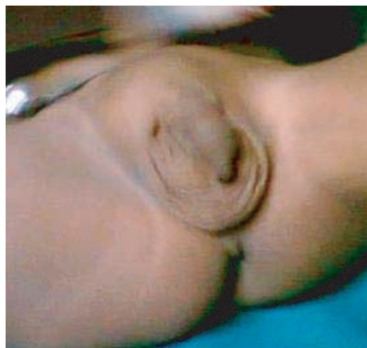
Figure 3: Follow-up after one year of surgery

Cystic swellings during inguinal dissection are rare to find 1 . Although hernia is the most common abnormality of the inguinal region 2 , other pathological entities may also be found