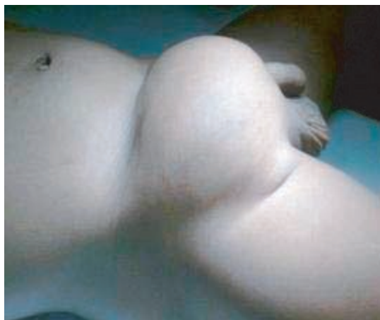
Figure 1: Inguinal Cystic Hygroma ( Pre-operative)

Surgery was performed through the right inguinal incision. A large multicystic mass measuring 7 cm x 4 cm x 2 cm (Figure 2) was found in the subcutaneous