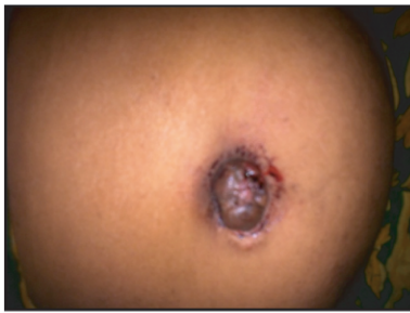
Figure 1: Photograph showing menstruating primary umbilical endometriosis.