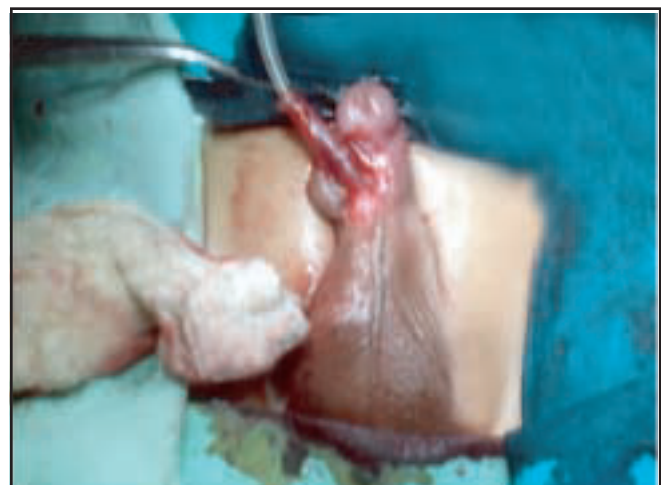
Figure 1 : After tubularization of lateral based flap

Postoperatively all patients were treated by antibiotics and analgesic. Second-generation intravenous cephalosporin was given postoperatively for 2 weeks. After urethroplasty (for both groups) urinary diversion in the form of urethral catheter were kept in position for 10 days. Findings were registered in each follow up at 10th day (day of discharge), 3 rd week, 5 th week, 8 th week, 12 th week postoperatively. Results were evaluated after 6 months and onward.