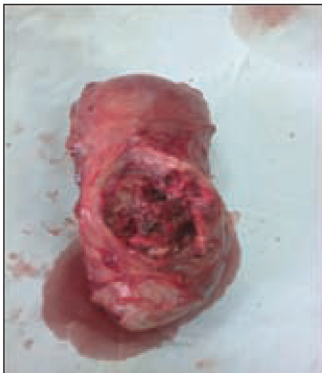
Figure 1: Product of conception within endocervical region.