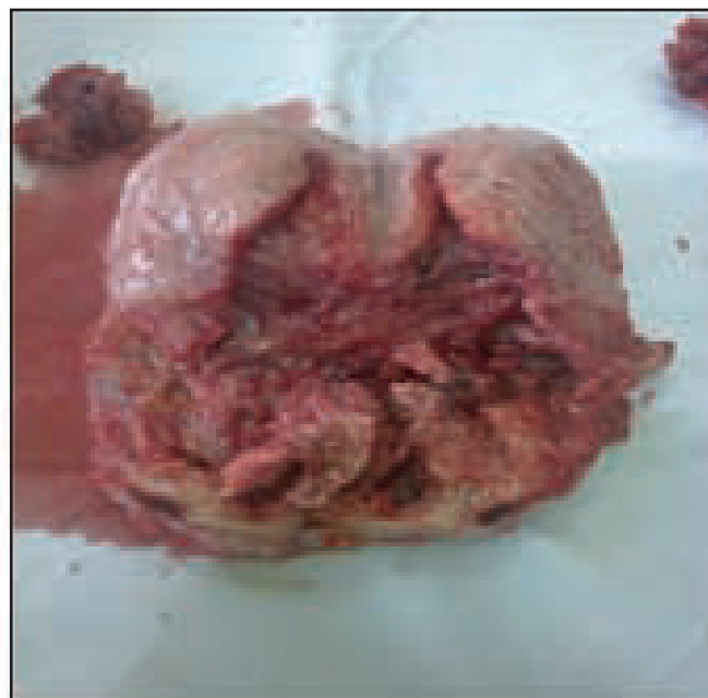
Figure 2: Endometrial cavity is empty.

On laparotomy findings body of the uterus looks little bit bulky lies above the distended cervix. Whole uterus was 16 weeks size, cervix was distended seems to be full with something within it and fundus was compatible with cervix with a narrowing in between them. Decision was taken for hysterectomy. After giving first clamp and vesico uterine peritoneum was dissected out then a vertical incision was given over the cervix, moderate amount of product of conception was seen within the endocervical region, it was removed digitally and diagnosed as a case of cervical pregnancy. Bleeding was continuing and total abdominal hysterectomy was done without any perioperative difficulties. Time of operation was 45 minutes. Two units of fresh blood were transfused during operation. Tissue was sent for histopathological examination. Report showed chorionic villi within endocervical region and secretory changes within the endometrium. No cells of granuloma or malignancy were seen. Her serum hCG level was less than 1. Postoperatively patient was recovered well and discharged from hospital on 7 th postoperative day.