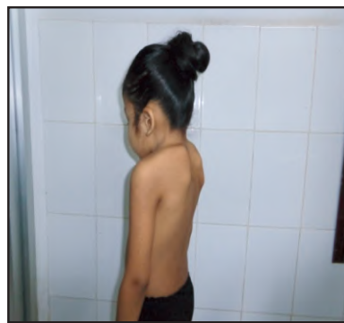
Figure 2 : Clinical photograph showing sprengel shoulder