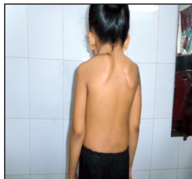
Figure 3 : Clinical photograph showing low posterior hairline and elevated left scapula