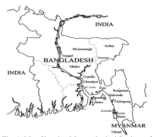
Fig. 1: Map Showing Meteorological Stations of Eastern Part of Bangladesh

There are many meteorological stations in Bangladesh. These stations record various climatologically data such as temperature, pressure, wind, rainfall, relative humidity over