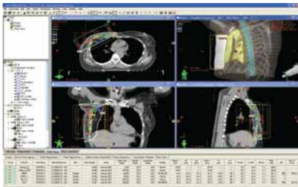
Fig. 1(a): Radiotherapy planning for post-mastectomy cases

Figures showing planning of radiotherapy with dosimetry (Fig. 1a, b, c & d).