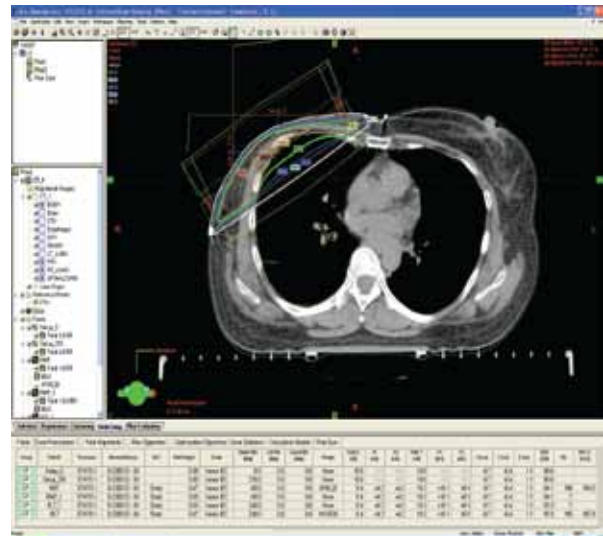
Fig. 1(b): Radiotherapy planning for post-mastectomy cases