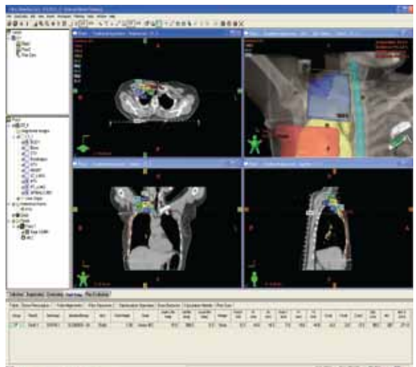
Fig. 1(c): Radiotherapy planning for supraclavicular fossa