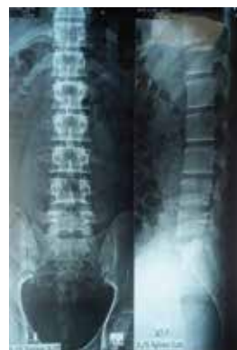
Fig 1: X-ray lumbo-sacral spine (A/P & lateral view) showing straightening of the vertebra [Pre-operative]

Radiology revealed straightened lumbar curvature due to muscle spasm (Fig 1). MRI showed thecal sac indentation at L3-L4, L4-L5 levels due to posterior disc bulge and large Tarlov cyst at S1-S2 level of spinal canal. Marrow signal intensity appears normal on T1W1 and T2W1 (Fig 2).