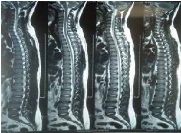
Fig 2: MRI of lumbo-sacral spine with screening of whole spine showing Tarlov cyst at S1 & S2 region (Red arrowed) [Pre-operative]

After sacral laminectomy, microsurgical cyst fenestration was performed. Briefly, after exposure of the L5-S1 sacral nerve roots, a large cyst was identified at S1 and S2 level of cord. The thin transparent cyst wall membrane was widely fenestrated with a scalpel and microscissors. A clear fluid content of the cyst was drained. Then cystectomy was performed with plication of the cyst wall. The wound was closed in layers.