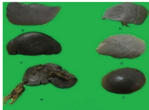
Fig. 1: Photograph showing different shapes of spleen. a. Tetrahedral, b. Wedge, c. Triangular, d. Oval, e. Irregular, and f. Disc shaped

All data collected from specimens of each cadaver were recorded in the pre designed data sheet, analysis by SPSS program and compared with the findings of other national and international studies and standard text books. Observation of different shapes of spleen was noted.