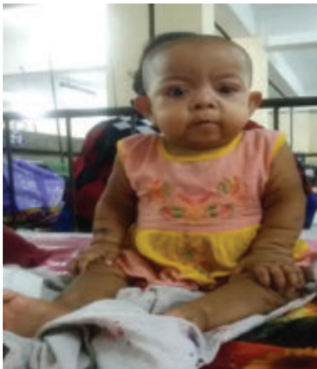
Fig 1 Cutis Laxa syndrome, samia 16 month, note redundancy of skin folds sagging jaws, a hooked nose with everted nostrils, a short columella, along upper lips and everted lower eyelids and downwards slanting palpebral fissures, a broad flat nose and large ears.