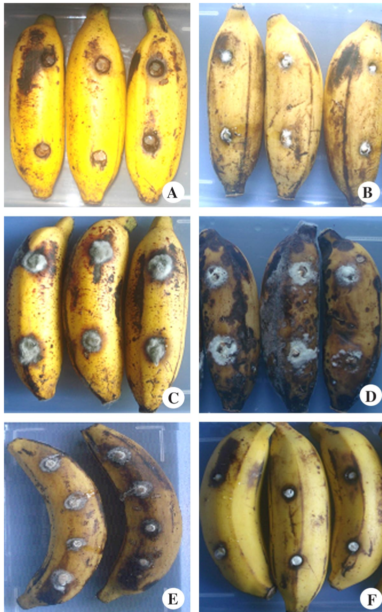
Fig. 3. Pathogenicity test of banana fruits of different varieties. Control (A), inoculated fruits with Colletotrichum musae (B), Curvularia brachyspora (C), Fusarium semitectum (D), Fusarium sp. (E) and Pestalotiopsis disseminata (F).

pathogenic to all the tested banana varieties. Control set remains fresh without showing any fungal growth (Fig. 3).