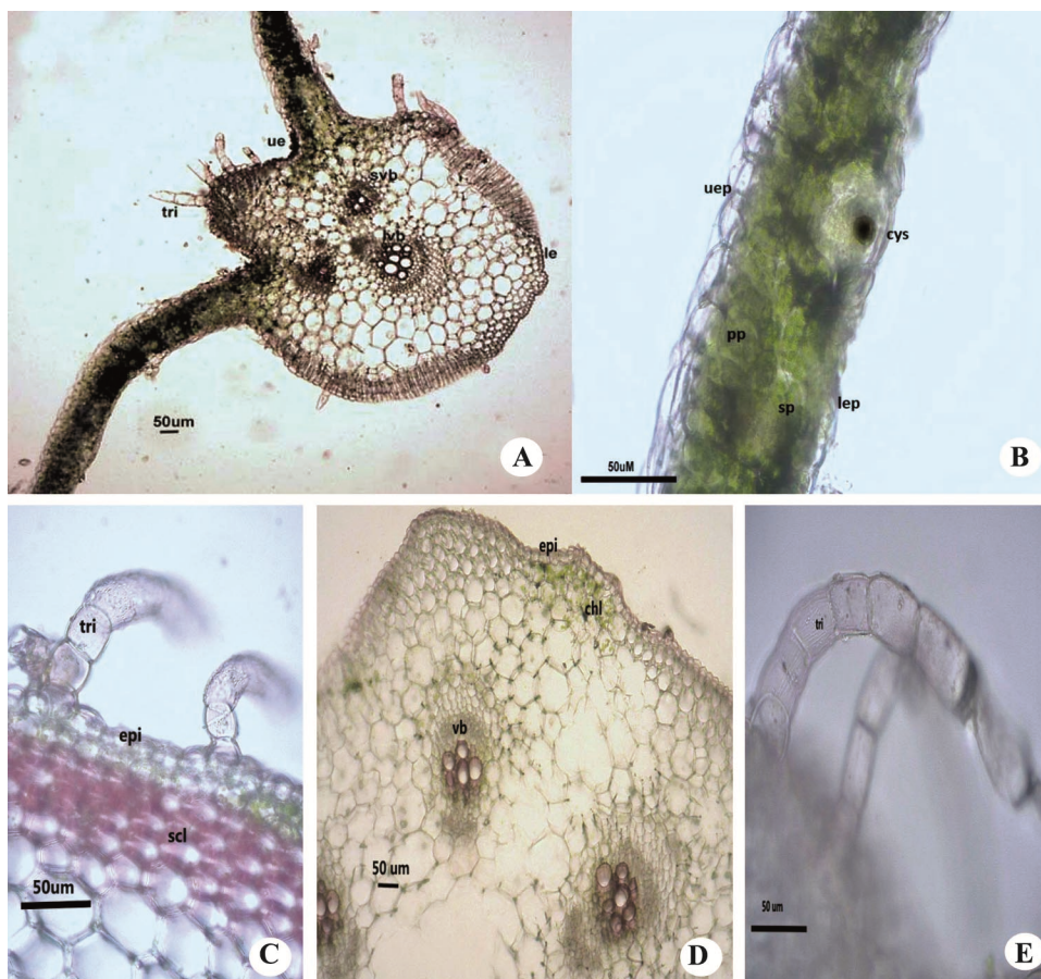
Fig. 2. Midrib showing one well developed vascular bundle and two small vascular bundles toward adaxial side from leaf transverse section of M. charantia under 50X magnification (A). Presence of stalkless globular cystoliths on the lower surface of lamina 100X magnification (B) and multicellular trichomes in the midrib under 400X magnification (C). Petiole transverse section of M. charantia (D) 100X magnification. Multicellular hook shaped trichomes on the epidermis of petiole (E) under 400X magnification. ue = upper epidermis, le = lower epidermis, svb = small vascular bundle, lvb= large vascular bundle pp = palisade parenchyma, sp = spongy parenchyma, cys = cystolith, tri = trichome, epi = epidermis, chl = chlorenchyma, cor = cortex. Bar = 50 \mu m.

From leaf transverse section of it is observed that midrib is distinct which is bulged towards the abaxial side and projected as angle towards the adaxial side (Fig. 2A) Upper epidermis and lower epidermis of the species have thin cuticle and uniseriate having